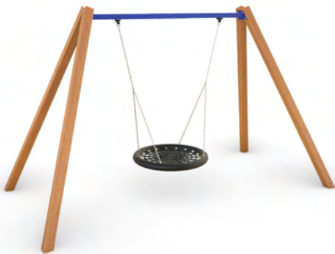
Timber Birds Nest Swing