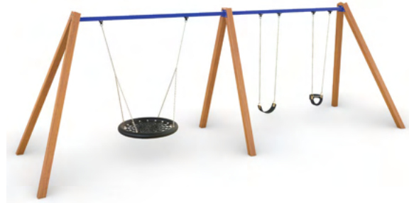
Birds Nest with Double Swing