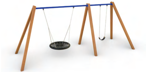
Timber Birds Nest with Single Swing