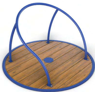
AP7108A Spiral Spinner 450