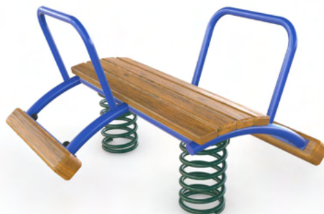
AP7112A Whirlpool Spinner 600