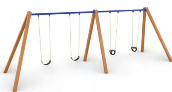
Timber Quadruple Swing