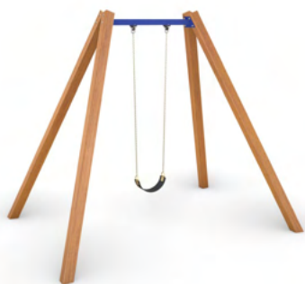
Timber Single Swing

Crafted from durable Australian steel and premium components, they're designed for endless fun, from a gentle sway to a soaring arc. Available in single, double, and nest configurations, with multiple height variations to suit different age groups and site requirements, these swings deliver reliable performance and timeless play value for schools, parks, and community spaces.