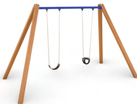
Timber Double Swing