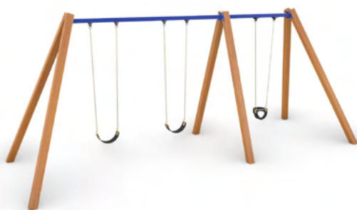
Timber Triple Swing