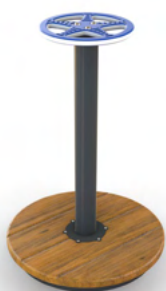
AP7024B Activity Spinner 600

Each spinner delivers smooth, controlled motion suited to different ages and abilities, while the rocker adds rhythm and teamwork to the play environment. Built for durability, safety, and lasting performance, these elements enhance both the function and visual appeal of any Fortitude playground project.