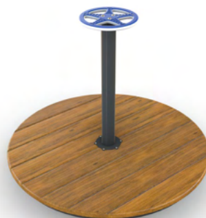
AP7023B Activity Spinner 1200